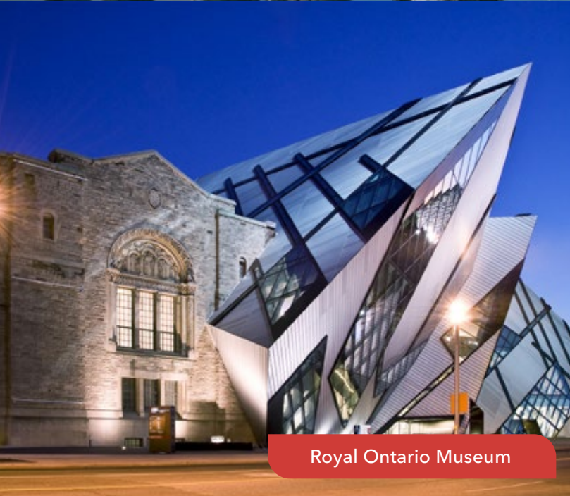
Royal Ontario Museum