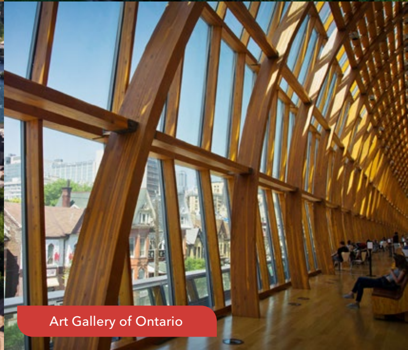
Art Gallery of Ontario